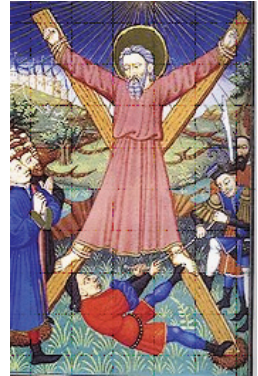
“St. Andrew’s Cross”